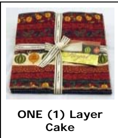
ONE (1) Layer Cake

Fabric requirements include the quilt top, borders and binding.