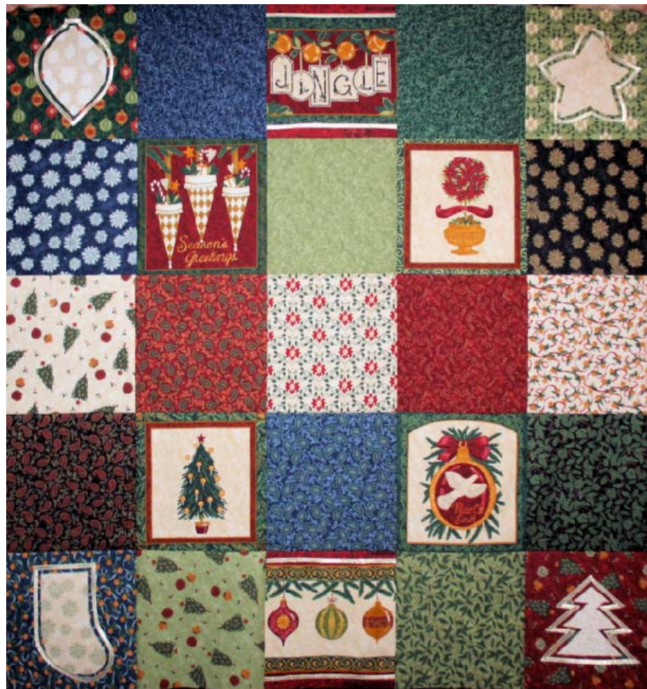
Photograph of Quilt Top before the borders and binding are added.

This pattern has been tested, to the best of our ability. If your block does not come out the size shown, please try adjusting your needle position to the appropriate position (left or right) and see if you get the correct block size.