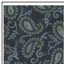
Paisley Royal 1 1/2 yards