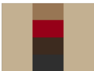
Block #3 Make EIGHT (8)