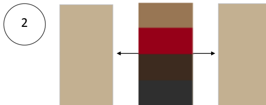
Make EIGHT (8)

This pattern has been tested, to the best of our ability. If your block does not come out the size shown, please try adjusting your needle position to the appropriate position (left or right)