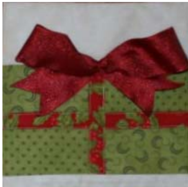
BOMquilts.com's Finished Block

Embellish your present with either a ribbon or the bow template.