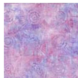
Blue Purple Quilt Blocks 5/8 yd.