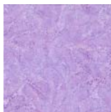
Light Purple Packed Ferns 1/8 yd.