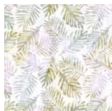
Cream Palm Leaves 2 yds.