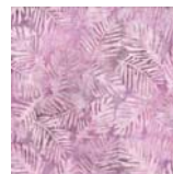
Pastel Purple Palm Leaves 2 yds.