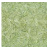
Green Pine Leaves 3/8 yd.