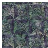
Dark Purple Green Packed Ferns 3/8 yd.