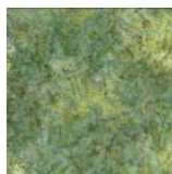
Green Packed Ferns 5/8 yd.