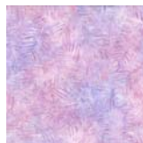
Light Purple Palm Leaves 5/8 yd.