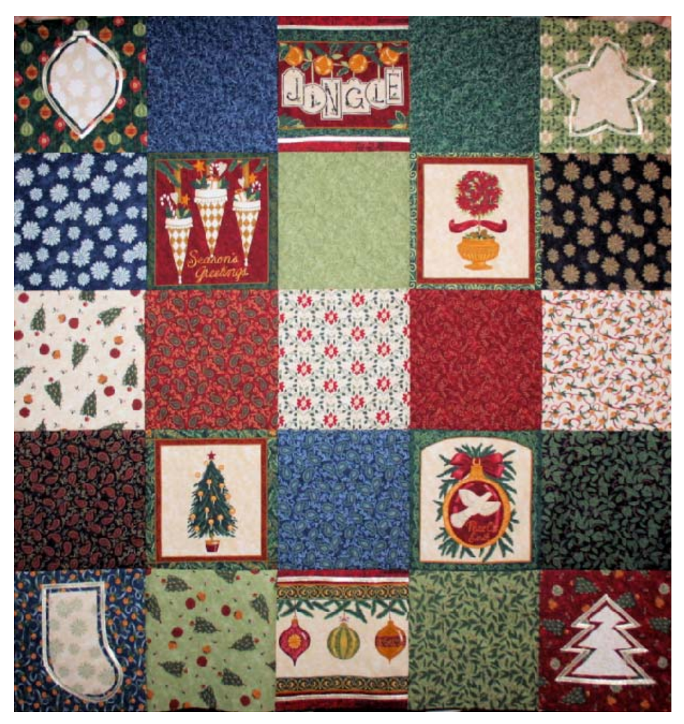
Photograph of Quilt Top before the borders and binding are added.

This pattern has been tested, to the best of our ability. If your block does not come out the size shown, please try adjusting your needle position to the appropriate position (left or right) and see if you get the correct block size.