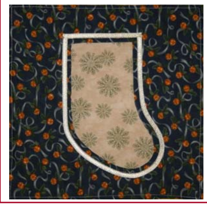
This is a layered block, with TWO (2) layer cakes. Begin by choosing the two layer cakes shown below: