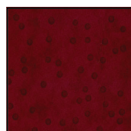
2 1/4 yds. Wine Tonal Holiday Dot