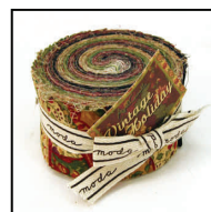
1 Jelly Roll