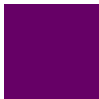
Fabric E 1 1/2 yard