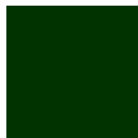
Fabric B 3/8 yard