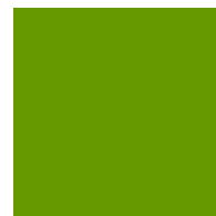
Fabric H 1 yard