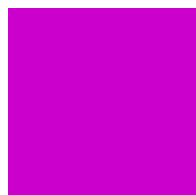
Fabric A 3/8 yard