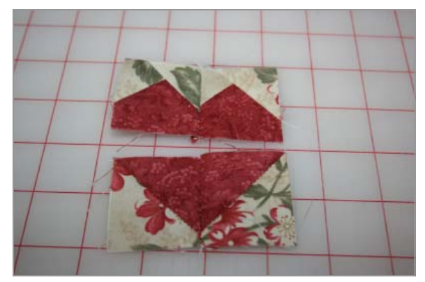
#7 - Your completed center should look like this, ready to sew the two halves of the heart together.