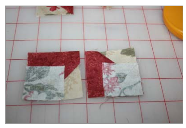
#6 - Repeat for the opposite corner of your heart.