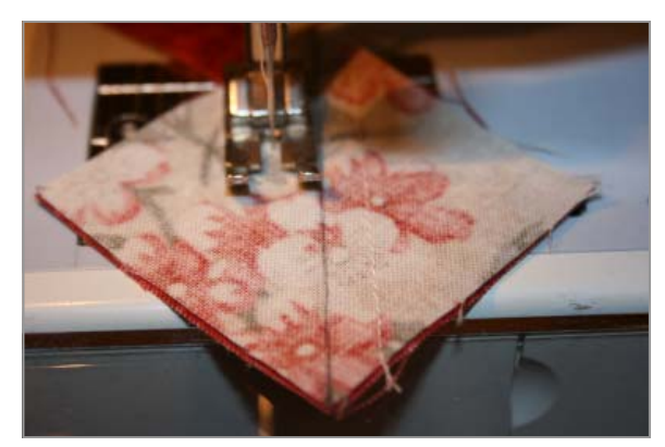
#2 - Draw diagonal line on the back of G-White fabric. Using a 1/4" seam allowance, sew on EACH side of the line you drew.