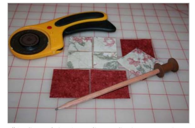
#1 - Cut Fabrics According to Cutting Instructions