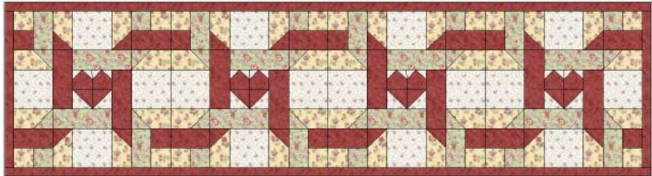
Table Runner is 36" x 10" finished