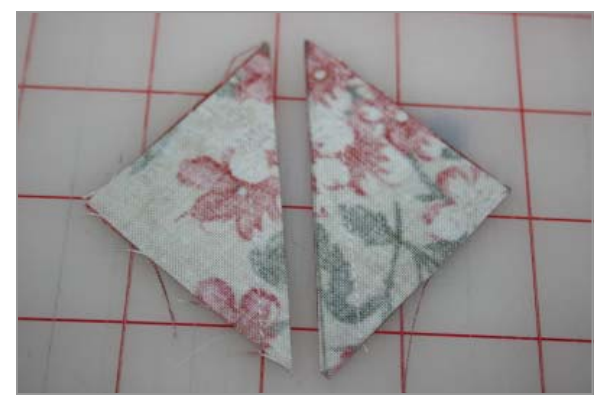
#3 - Cut your square apart ON the line you drew. Then, open and press in the direction of the Red fabric. You will end with TWO (2) half-square triangles that should measure 1 5/8" square.