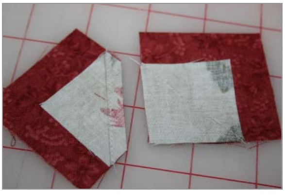
#5 - Once you've sewn the first corner on, cut the corner away 1/4" from your sewn line, then press open.