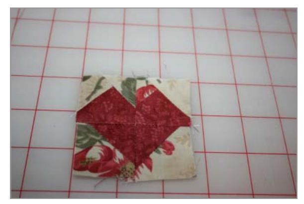
#8 - Your finished heart for the center of the block should measure 2 3/4" square.