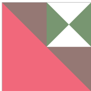
Block #1 - Quarter-Square Triangle Corner