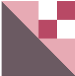
Block #2 - Four in the Corner