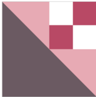
Block #2 - Four in the Corner