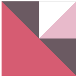
Block #3 - Half-Square Triangle in the Corner