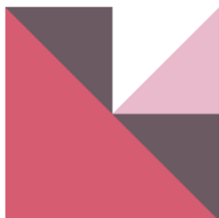
Block #3 - Half-Square Triangle in the Corner